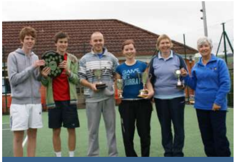
STC Adult Club Champions 2009

Our Quiz Night raised around £750 for club funds – a big thanks to all who helped!