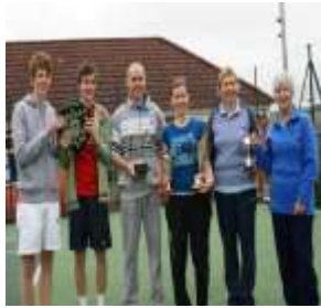
Club Champions 2009

The ever growing publicity surrounding Scone Tennis Club continues and this time we have had an article about the growth in our recent membership and club activities published on the Help for Clubs